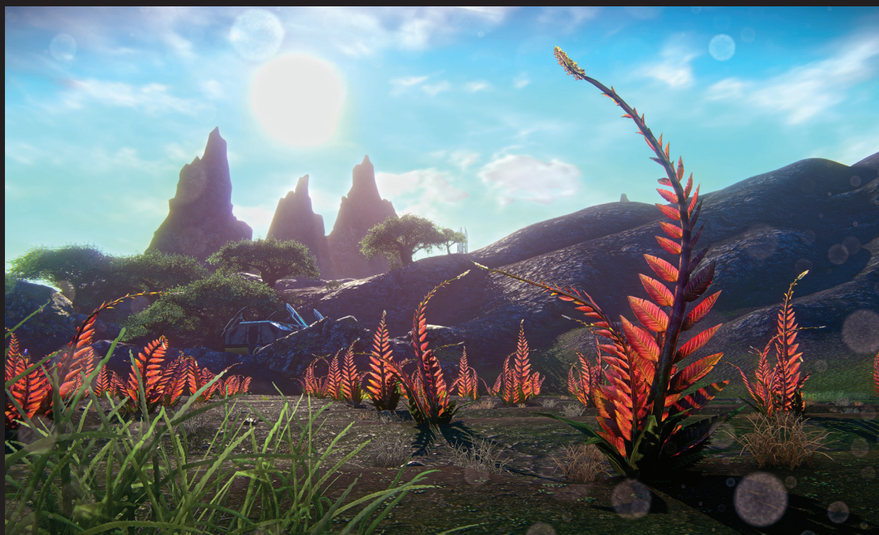
A screenshot from PlanetSide