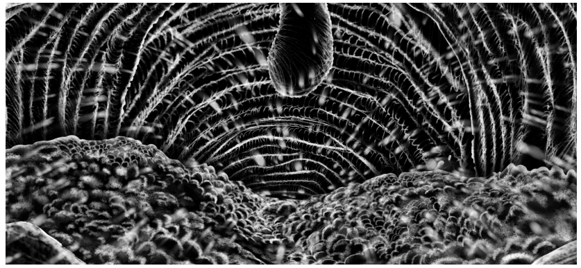
A screenshot from Will Love Tear Us Apart

Will Love Tear Us Apart focuses on emotional responses at the expense of other aspects of involvement; it lacks the spatial involvement and other aspects that create a strong sense of in-